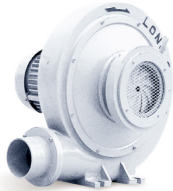
風車 Air Blower Motor